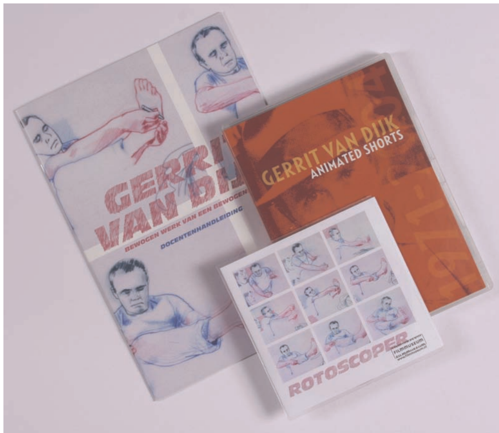
Figure 3: Gerrit van Dijk teaching materials: booklet, CD-ROM and DVD.