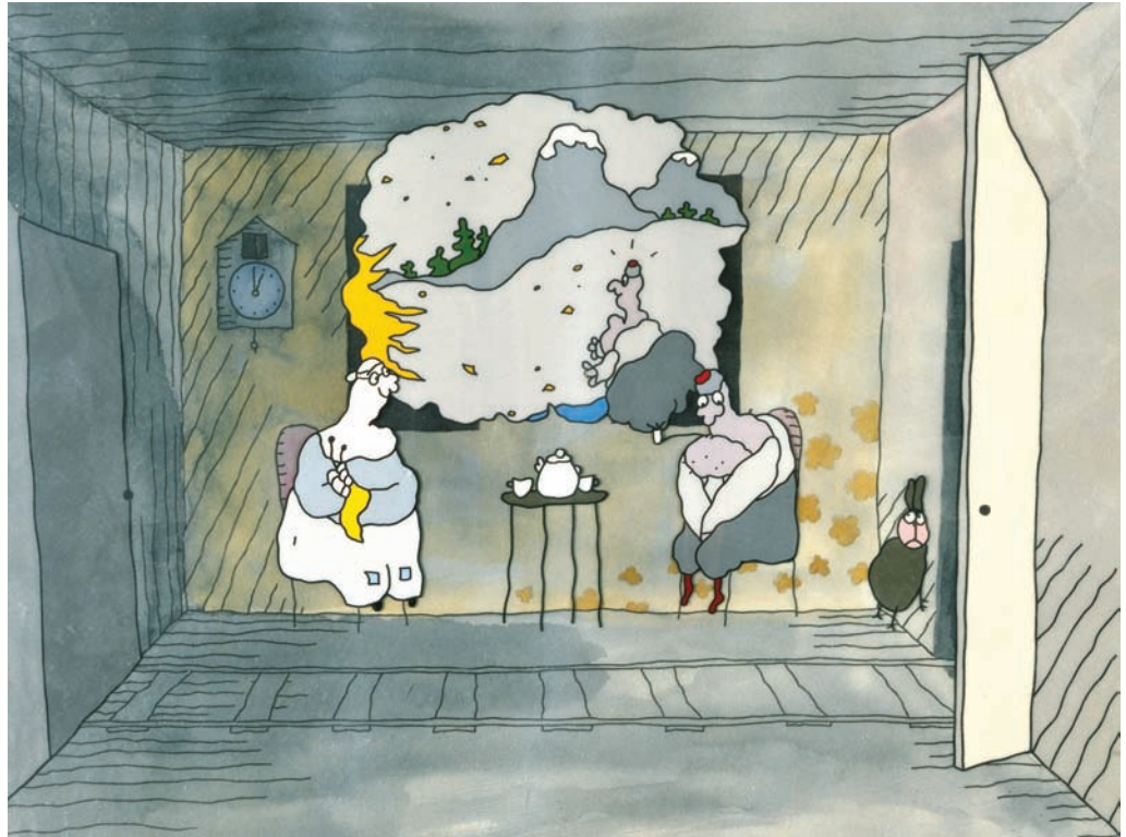
Figure 6: Home on the Rails (Paul Driessen, 1981).