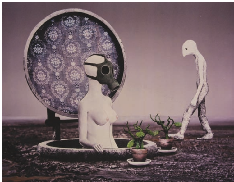
Figure 1: Once Again (Hans Nassenstein, 1982).