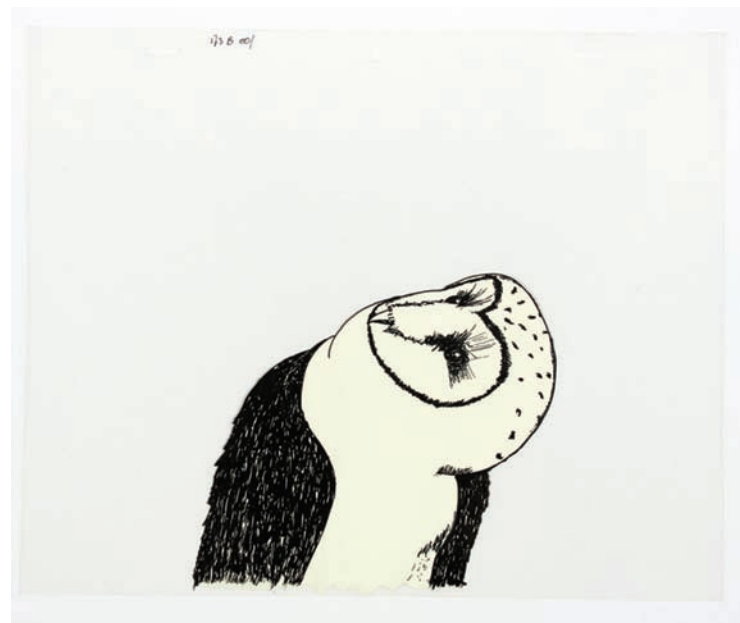
Figure 2: artwork for Music for an Owl (Ties Poeth, 1999).