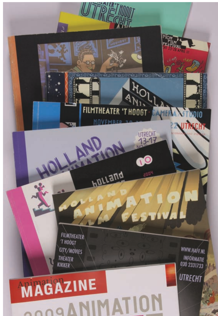
Figure 7: HAFF catalogues.