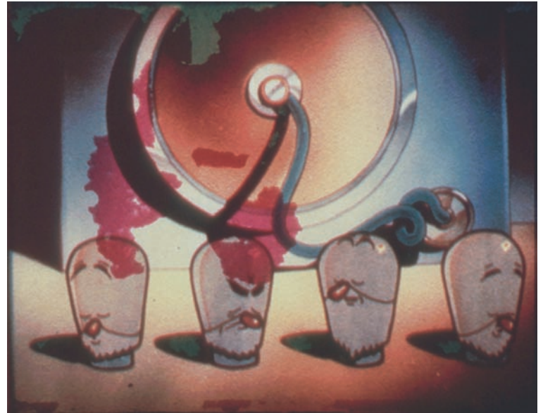
Figure 5: Two pieces of film stock of a George Pal film: one before and one after preservation.