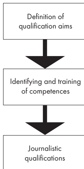
Figure 1: Analytic matrix on journalistic competences.

To fulfil these qualifications, a journalist needs certain competences. 2 These competences describe a disposition for journalistic action. The expression ‘key competences’ hints at the fact that competences are a precondition in meeting qualification. Competence in this sense includes knowledge, values and behavioural standards (see Weischenberg 1995: 492). Apart from a range of competences, journalistic action requires ability, willingness and the possibility to act.